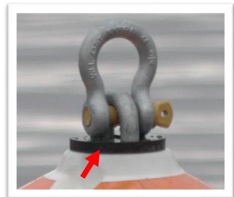
1. UHMW Wear Collar