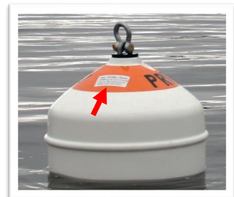
2. Protective overlay & owner info label